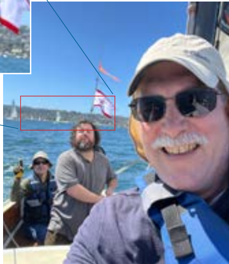
This selfie, shot from the foredeck of the E2 a third of the way along the second down wind run, shows the challenge faced by the rest of the fleet.

It was a great start to the 2024 season! 📌