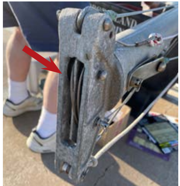
Here's part of the problem. The arrow points to one of the braided cables that is crossing over the divider separating the pulleys. Apparently, its not suppose to do that.