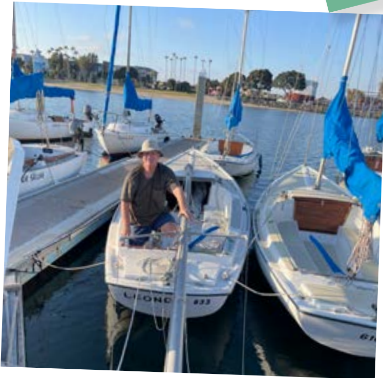
Repairs on the broken pulley assembly took place after the 22 foot mast was lowered. Repairs included removing and replacing most of the assembly, a project that took all afternoon and was completed at sunset.