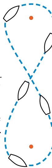
This diagram shows one of several patterns we run each Thursday.