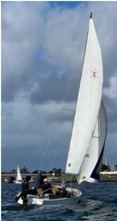
Ensign 1122 approaching the finish line near Ham's Lighthouse.

The 2024 Ensign racing season is fast approaching, with the first race starting this month.