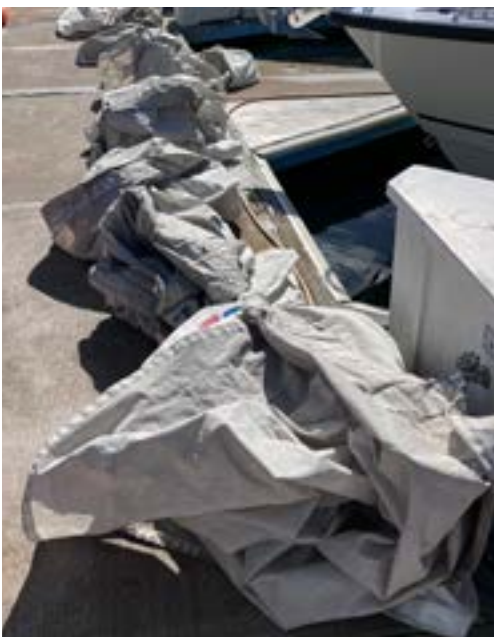
The old jib sails were washed and dried in preparation for their departure. A great deal of salt accumulates on the Jib.